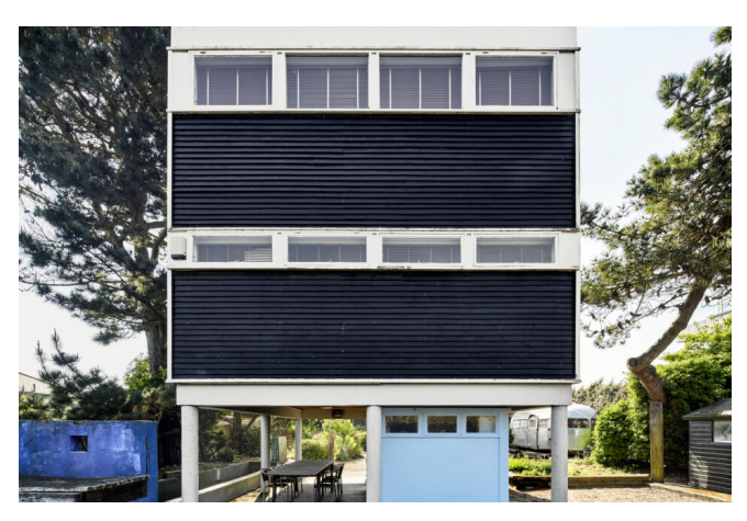
South-East England Sold