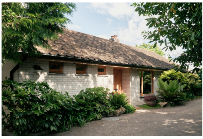
South-West England Sold