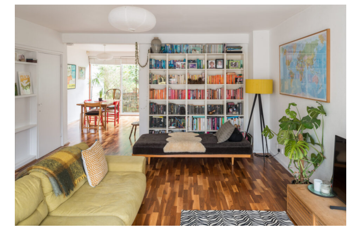
London, South London Sold