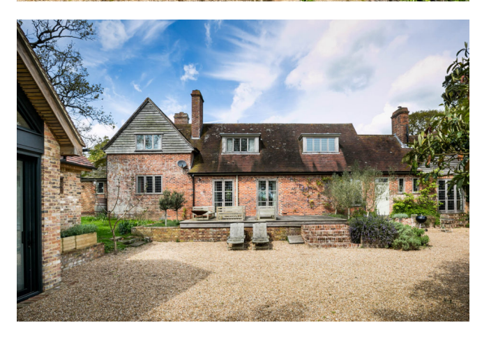
South-East England Sold