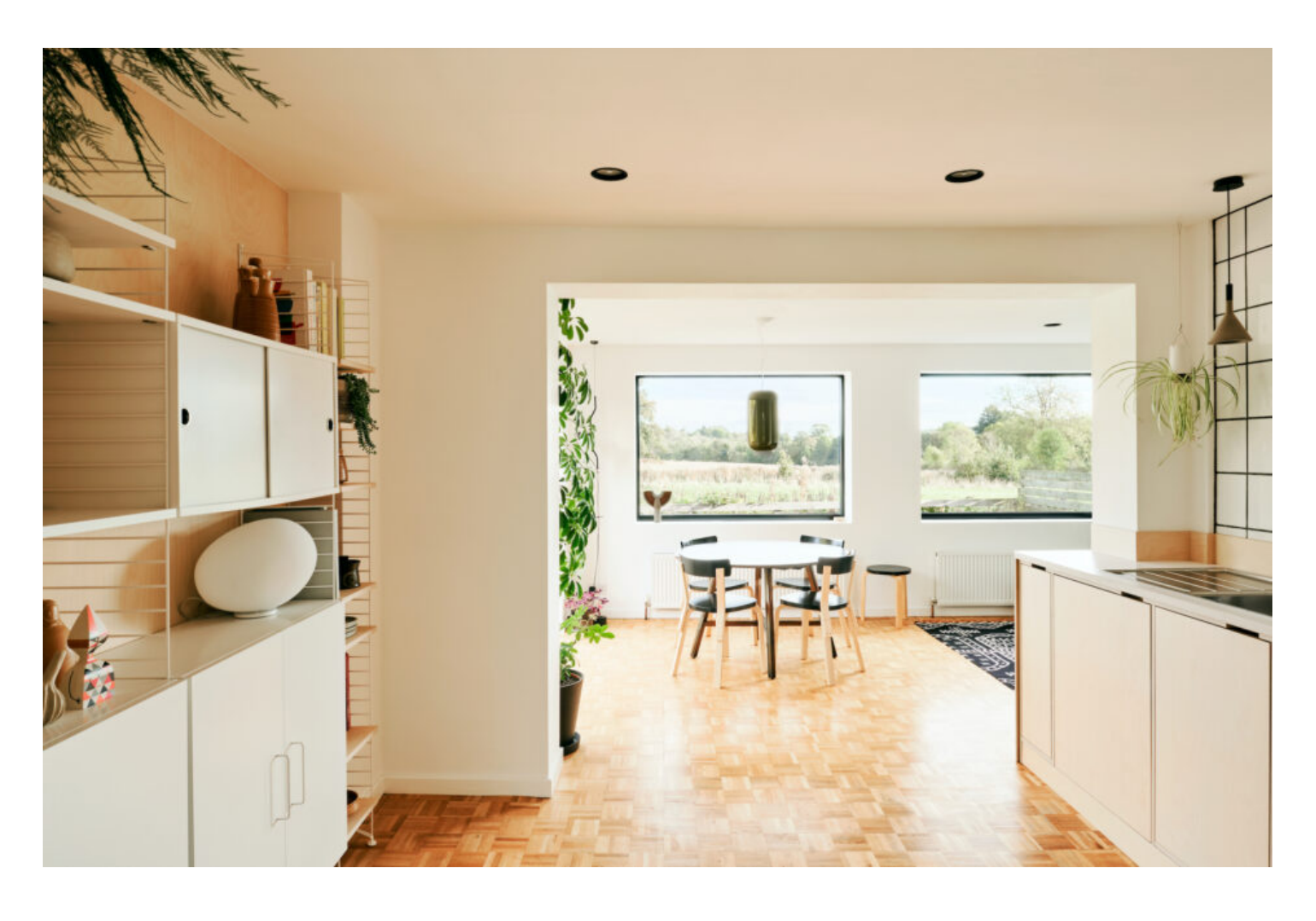
Pannal, North Yorkshire Sold