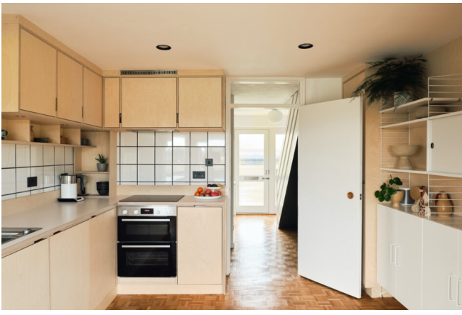
North England Sold