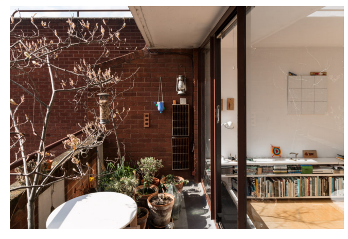
London, North London Sold