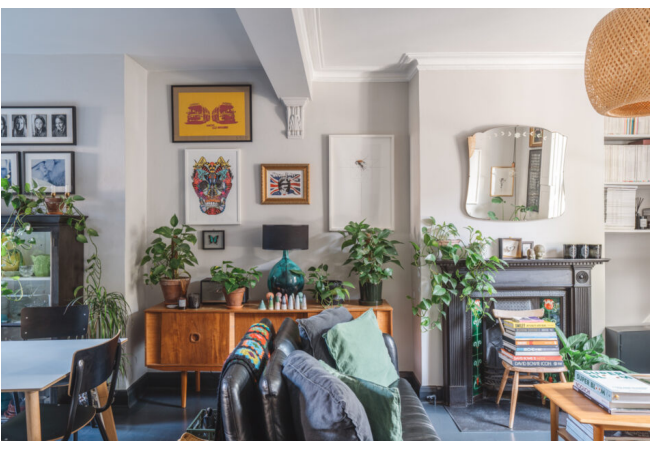
London, West London Sold