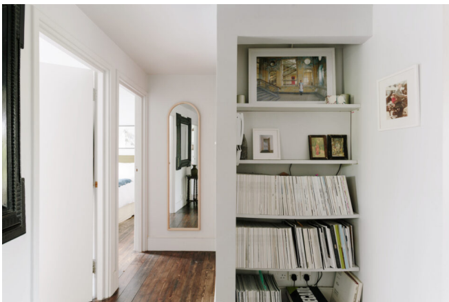
East London, London Sold