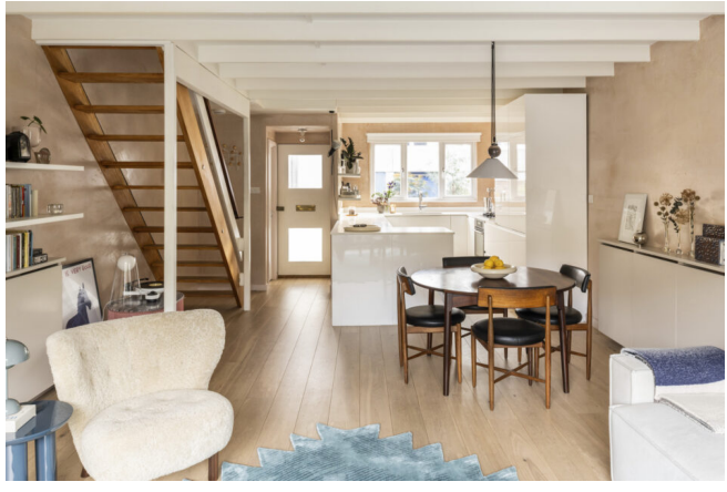
London, North London £965,000 Freehold