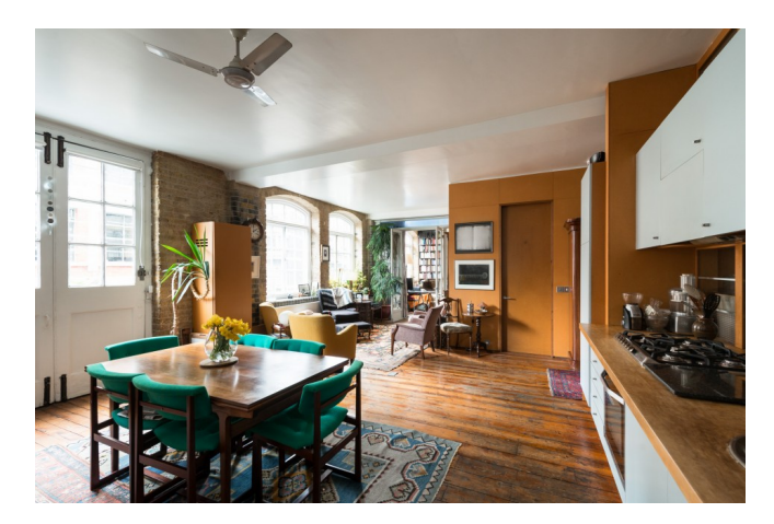
East London, London Sold