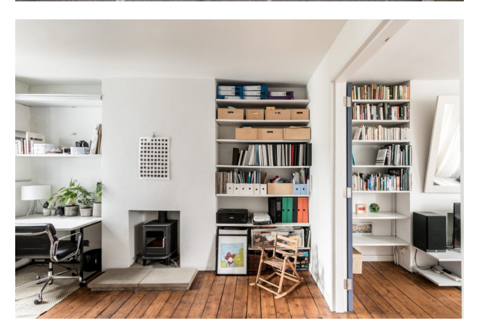
London, South London