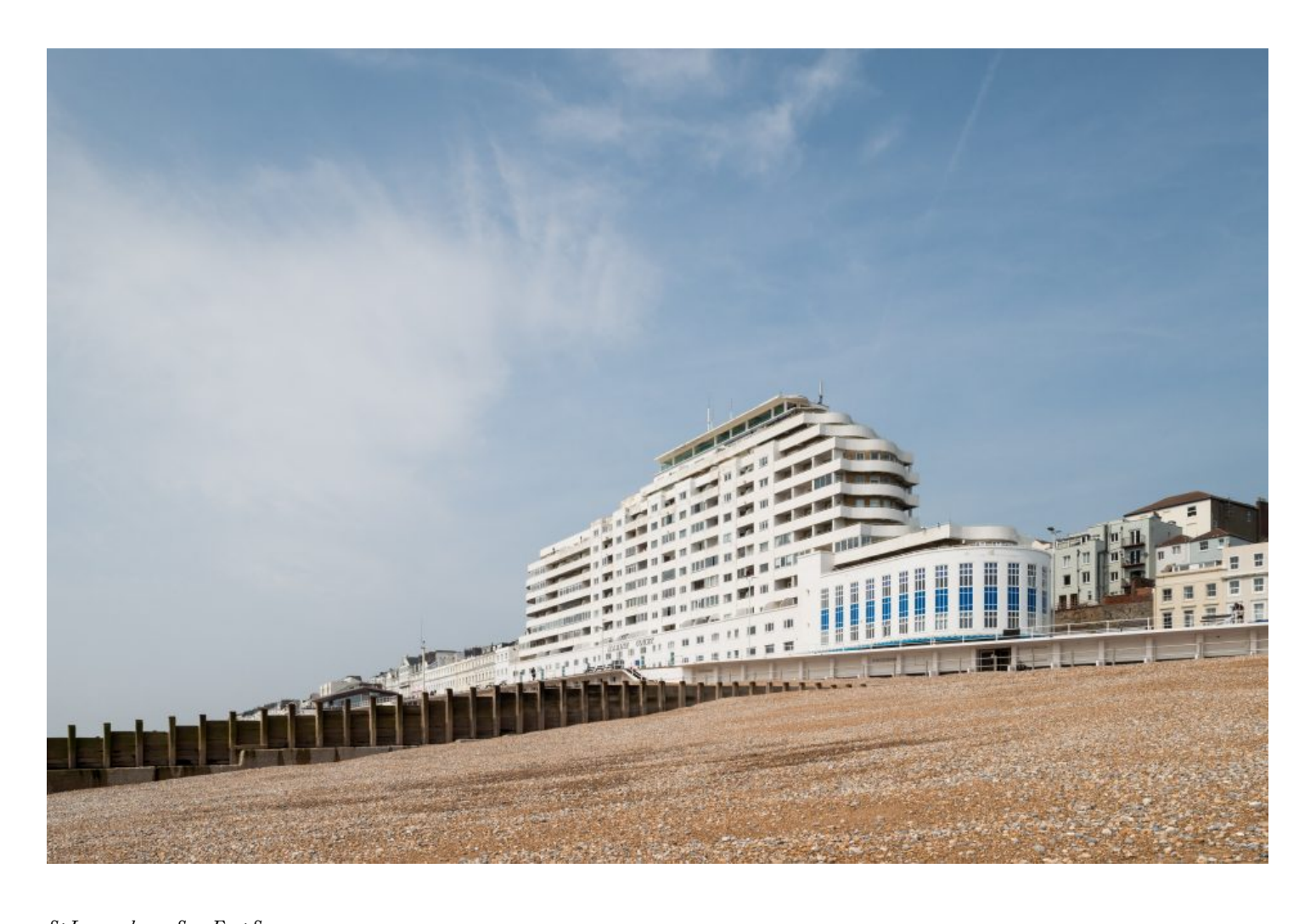
St Leonards-on-Sea, East Sussex Sold