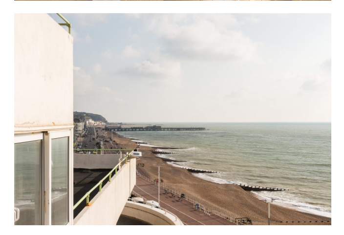
South-East England Sold