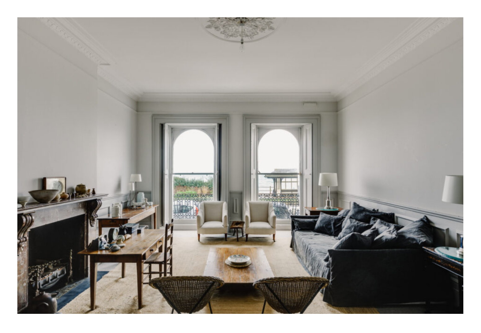
St Leonards-on-Sea, East Sussex Sold