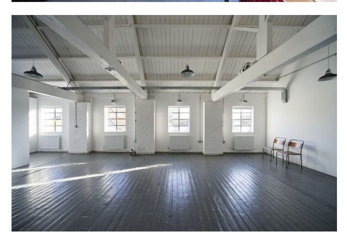
South-West England Sold