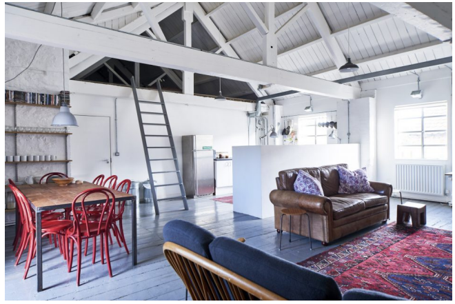
South-West England Sold