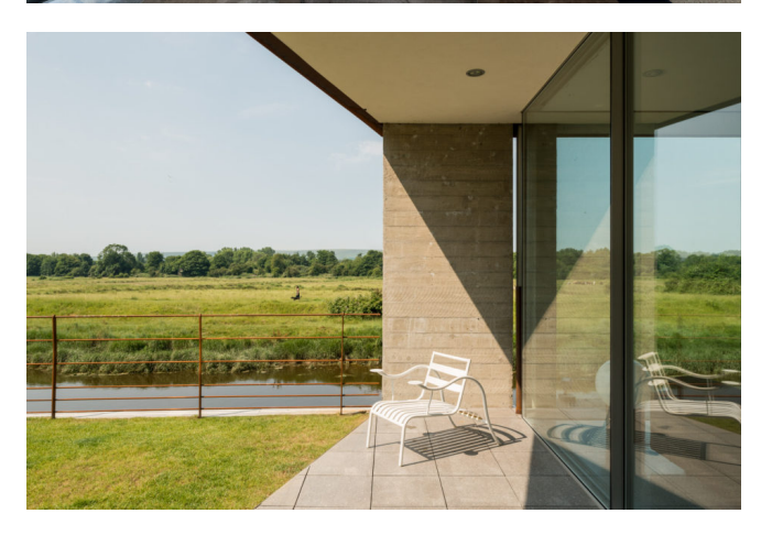
South-East England Sold