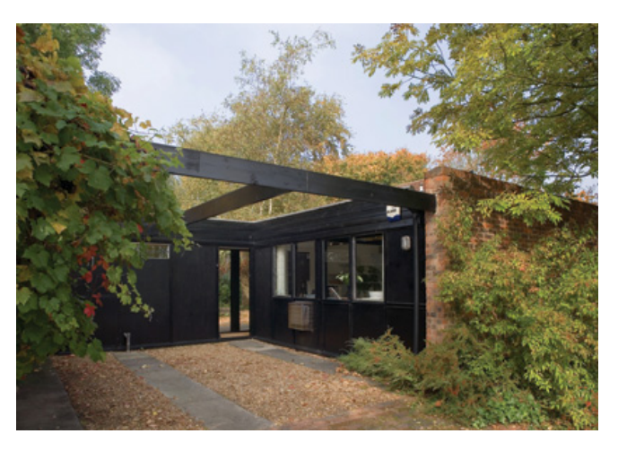
South-East England Sold