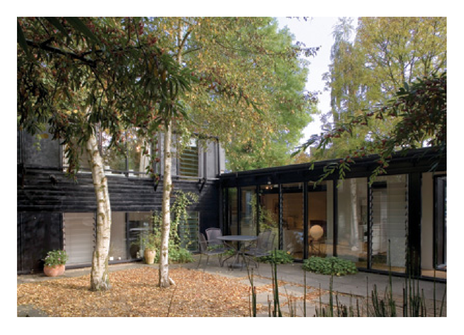
Stony Stratford, Buckinghamshire Sold