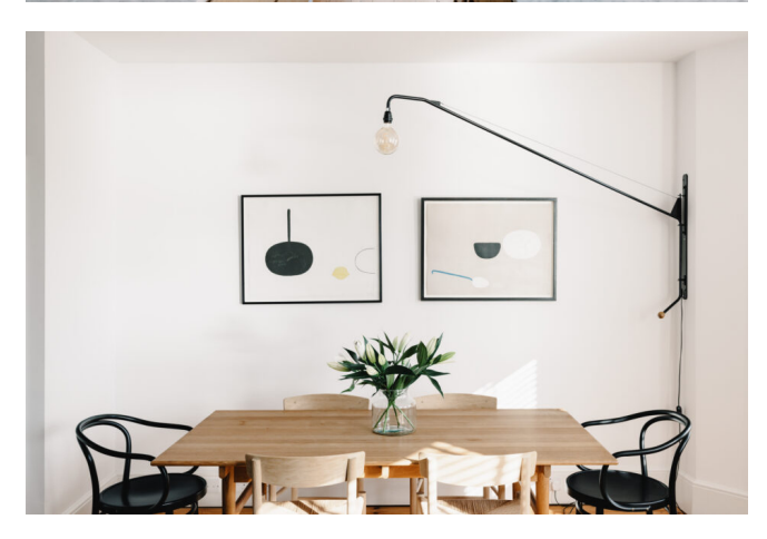
South-East England Sold