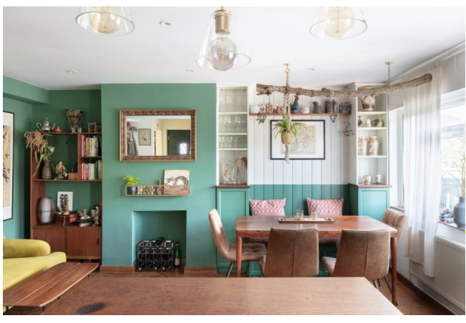
London, South London Sold