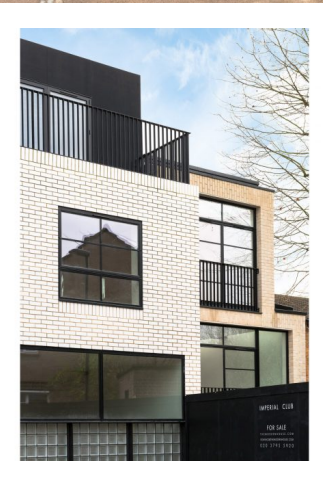
London, South London Sold