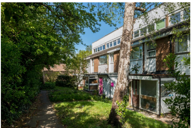
London, South London