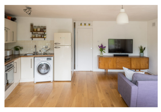
East London, London, South London Sold