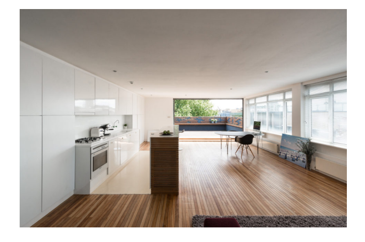
East London, London Sold