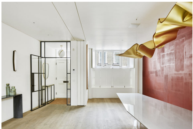
London, West London Sold