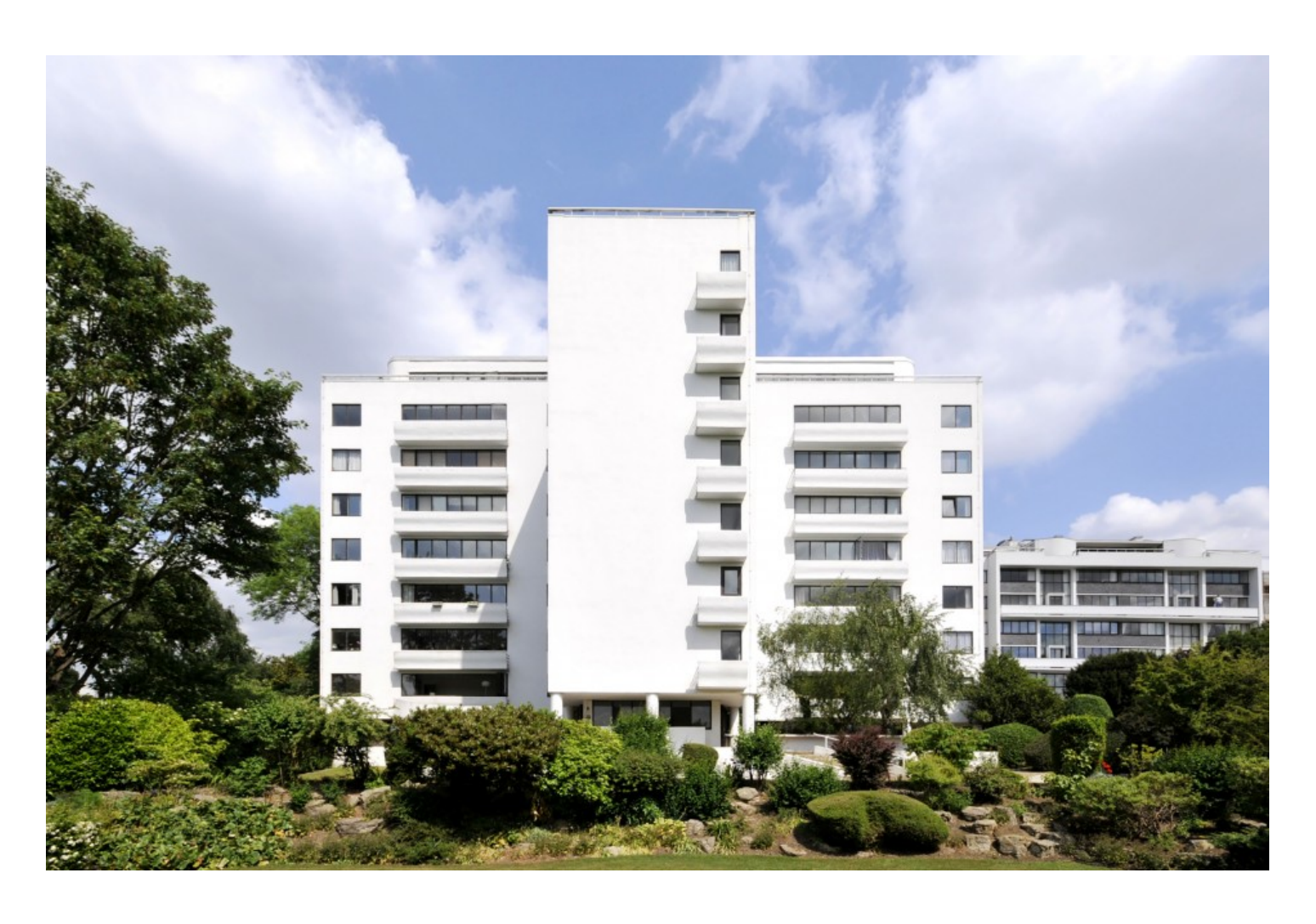
North Hill, London N6 Sold