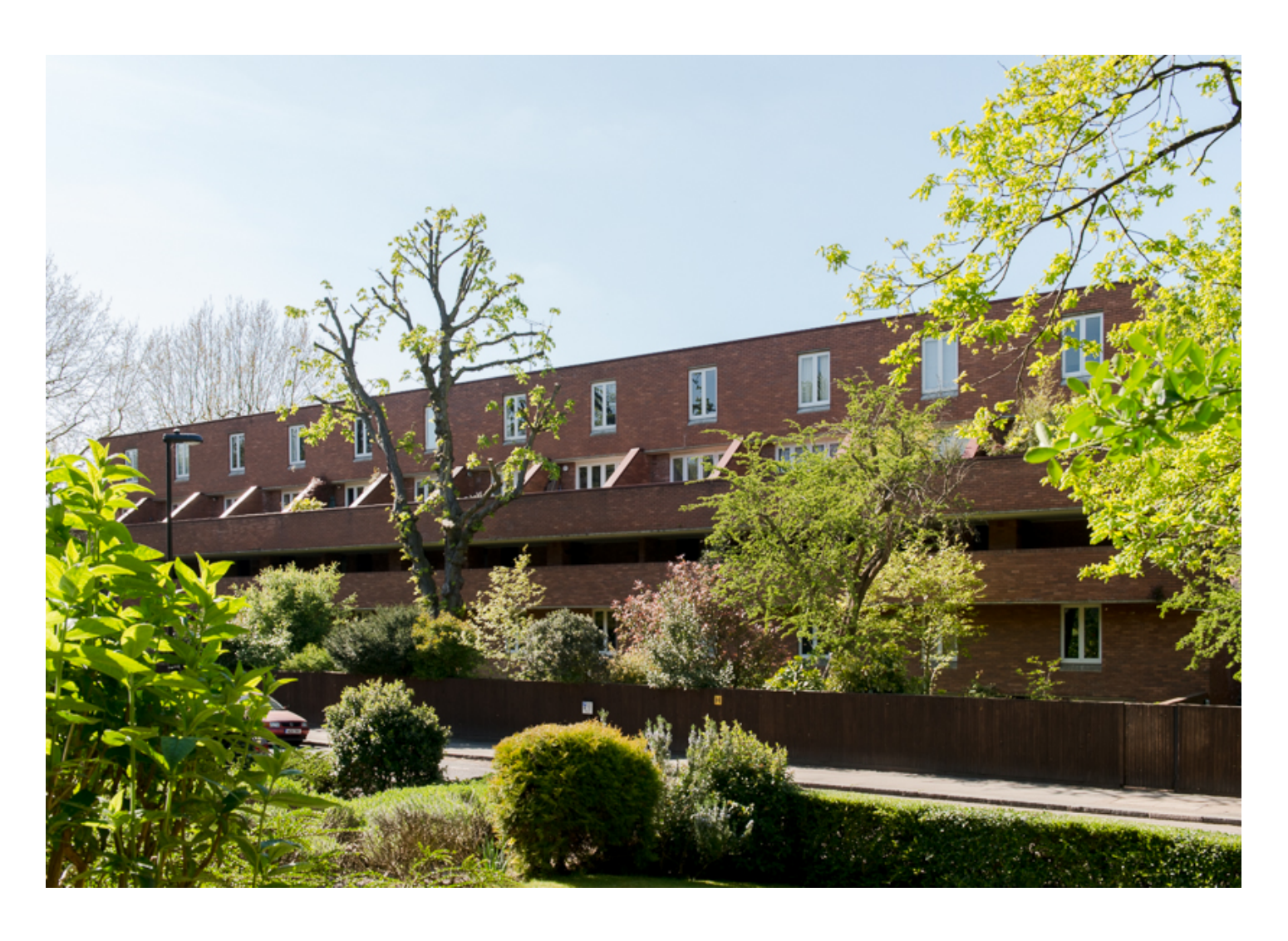
Crescent Road, London N8 Sold