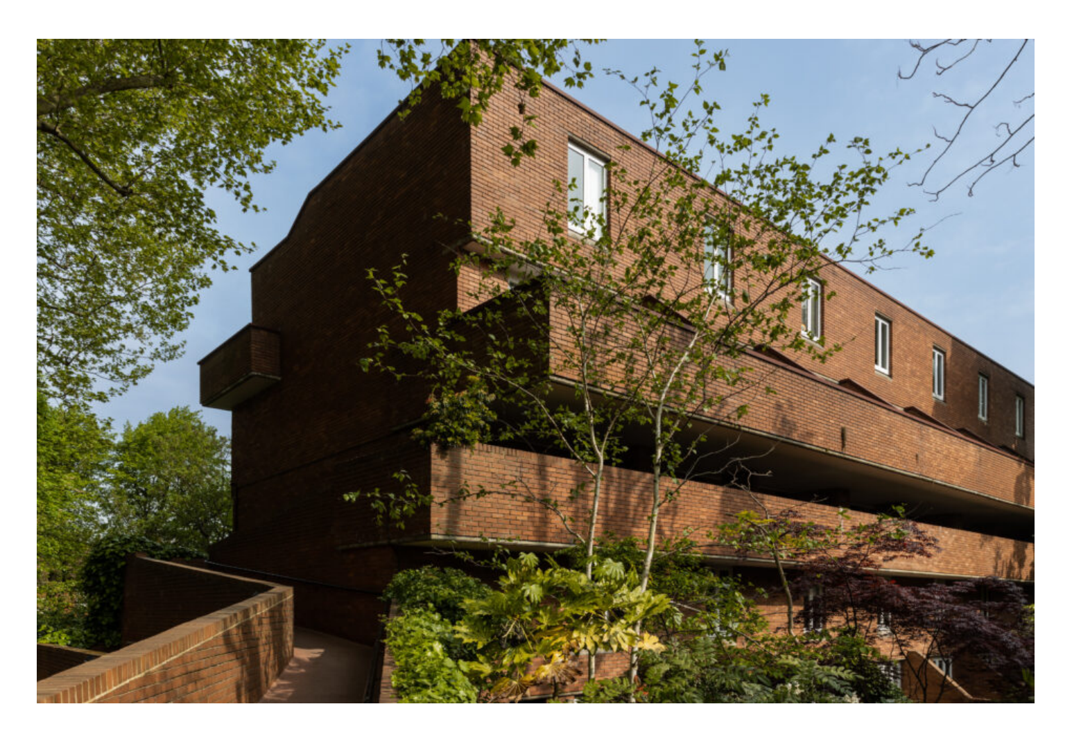
Crescent Road, London N8 Sold