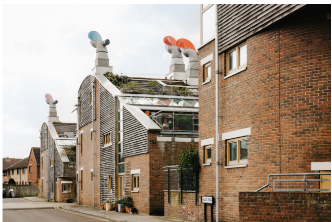
London, South London