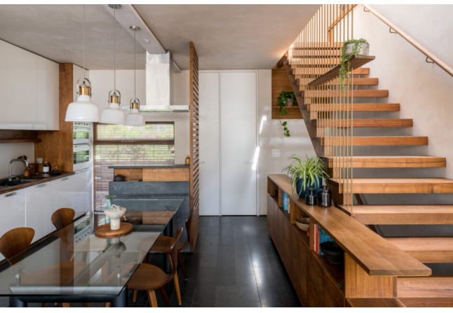
London, North London