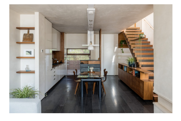
London, North London