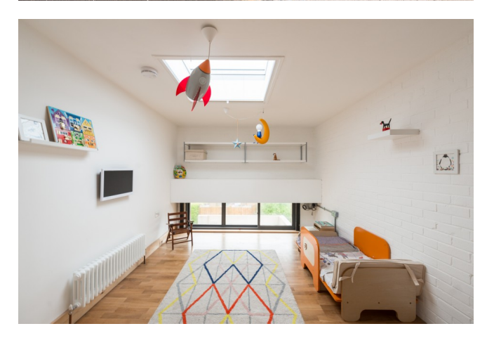
South-East England Sold