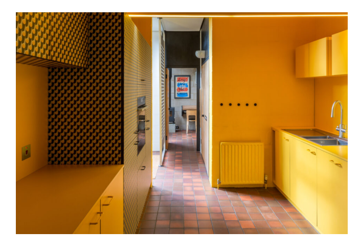
London, South London Sold