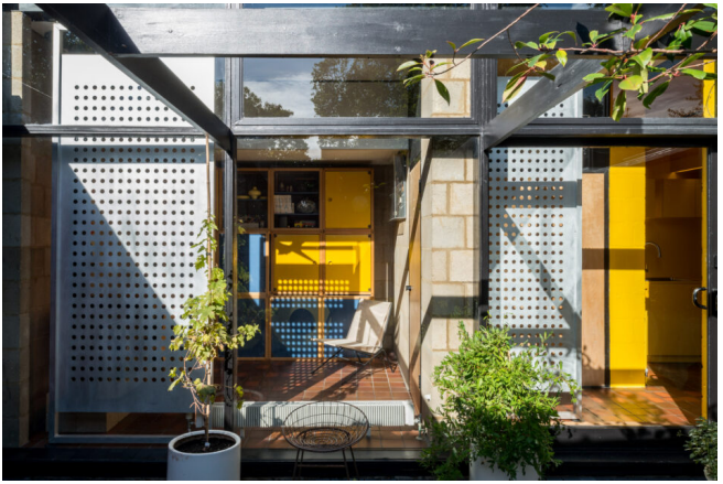
London, South London Sold