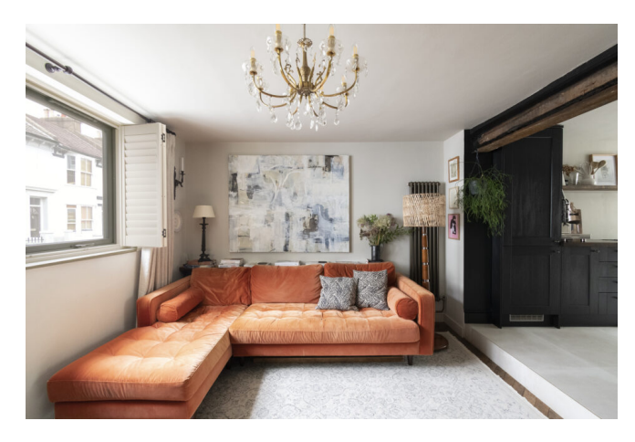
South-East England £575,000 Freehold