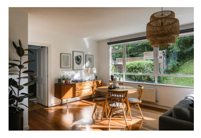
London, South London Sold