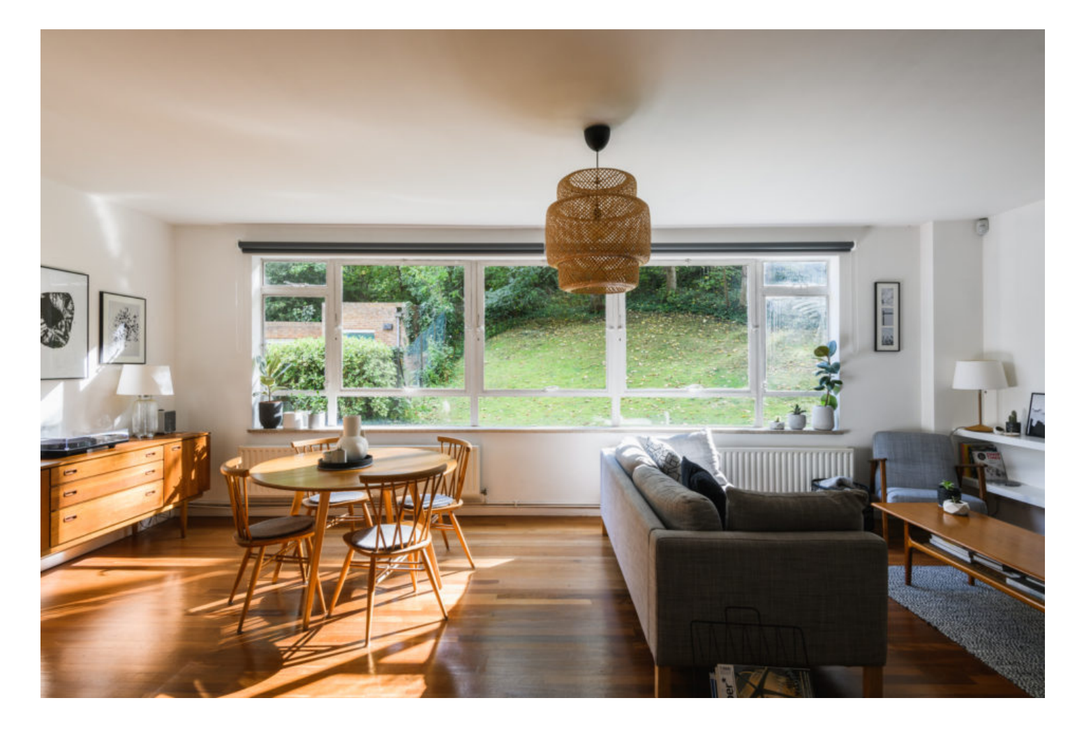
Lymer Avenue, London SE19 Sold