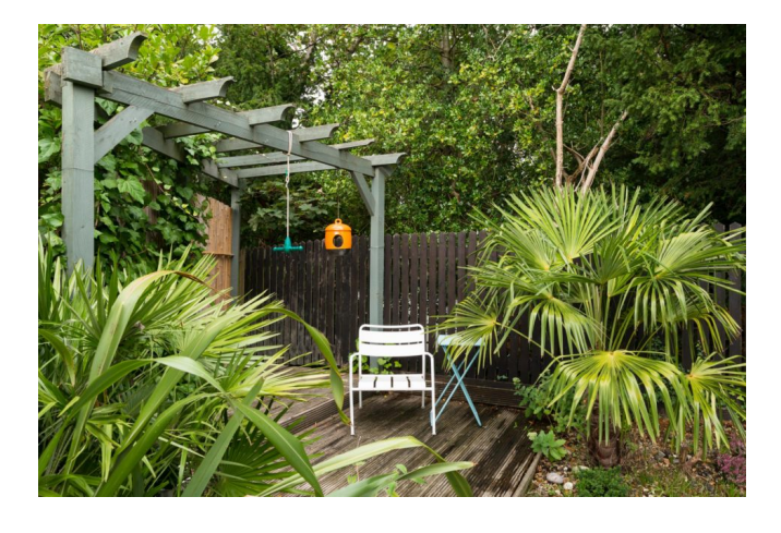
London, South London Sold