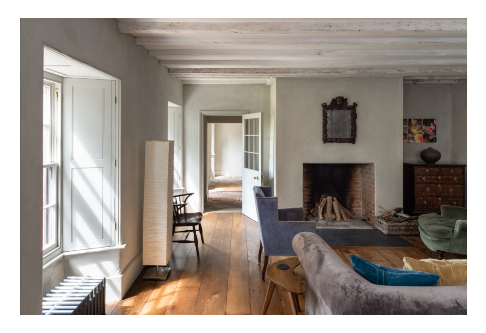
Llanfynydd, Carmarthen Sold