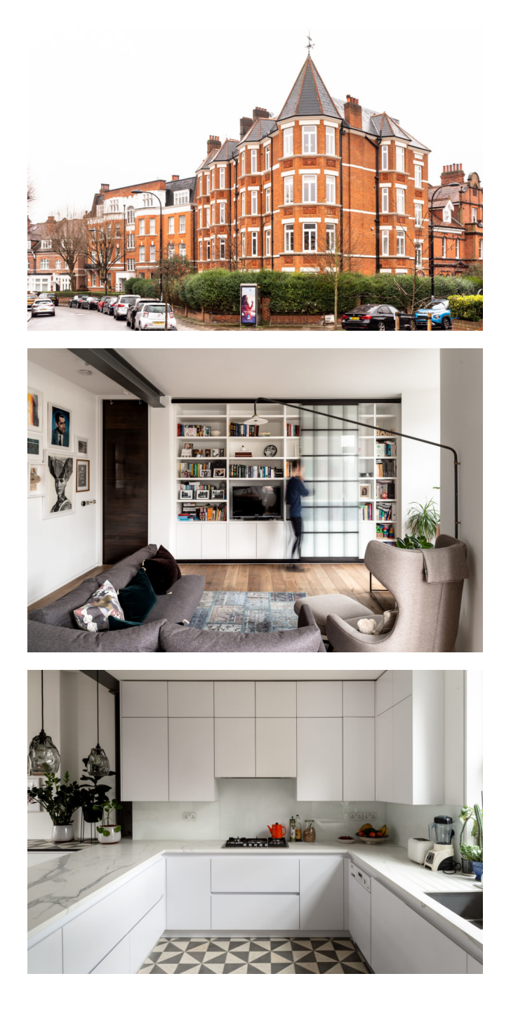
London, North London Sold