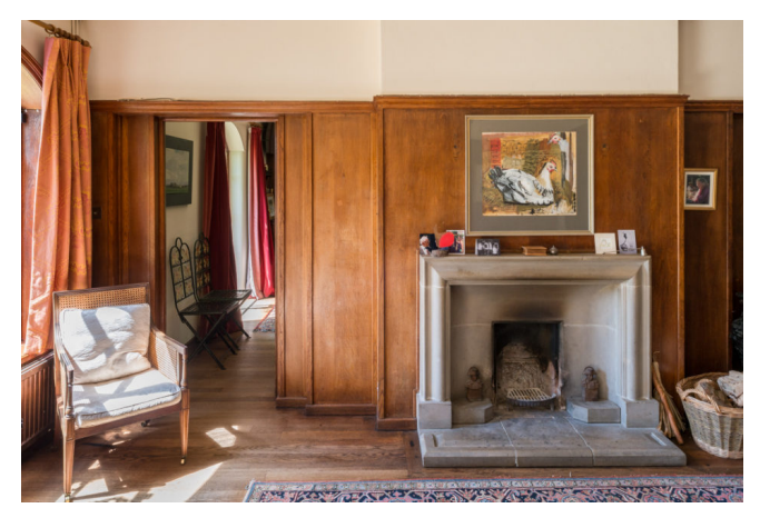
South-West England Sold