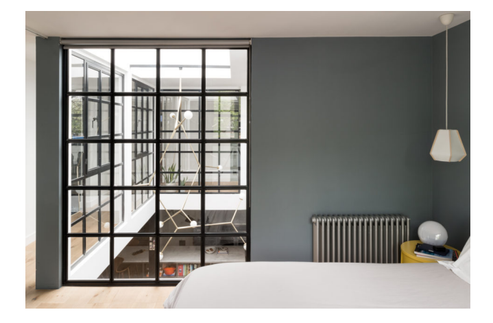
East London, London Sold