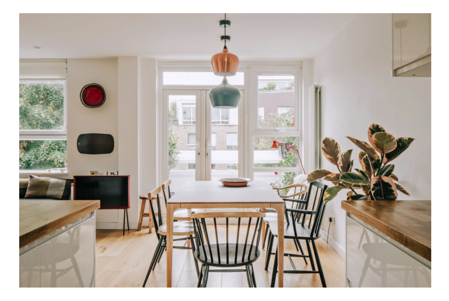
Highbury Grove, London N5 £785,000 Leasehold