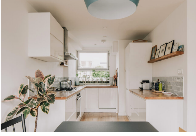
London, North London £785,000 Leasehold