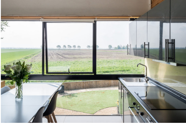
East Anglia, South-East England Sold