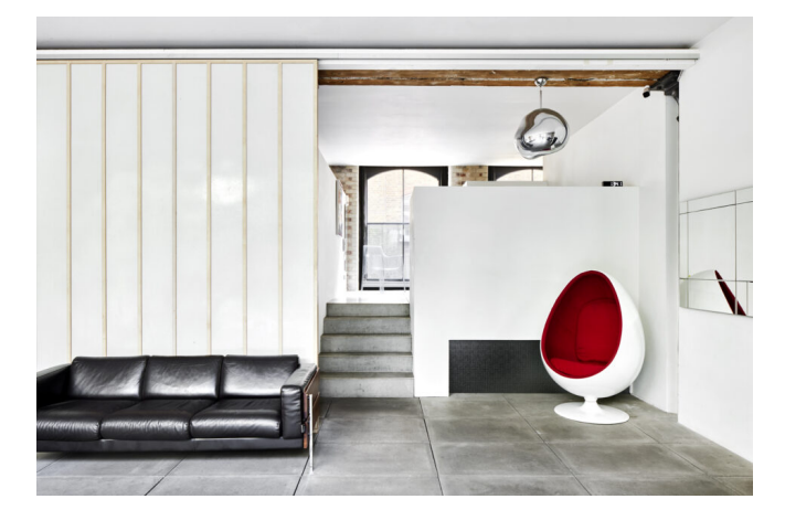
East London, London £1,850,000 Leasehold