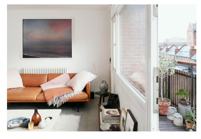
East London, London Sold