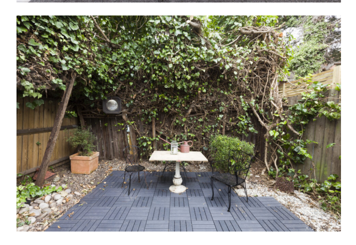
London, South London Sold