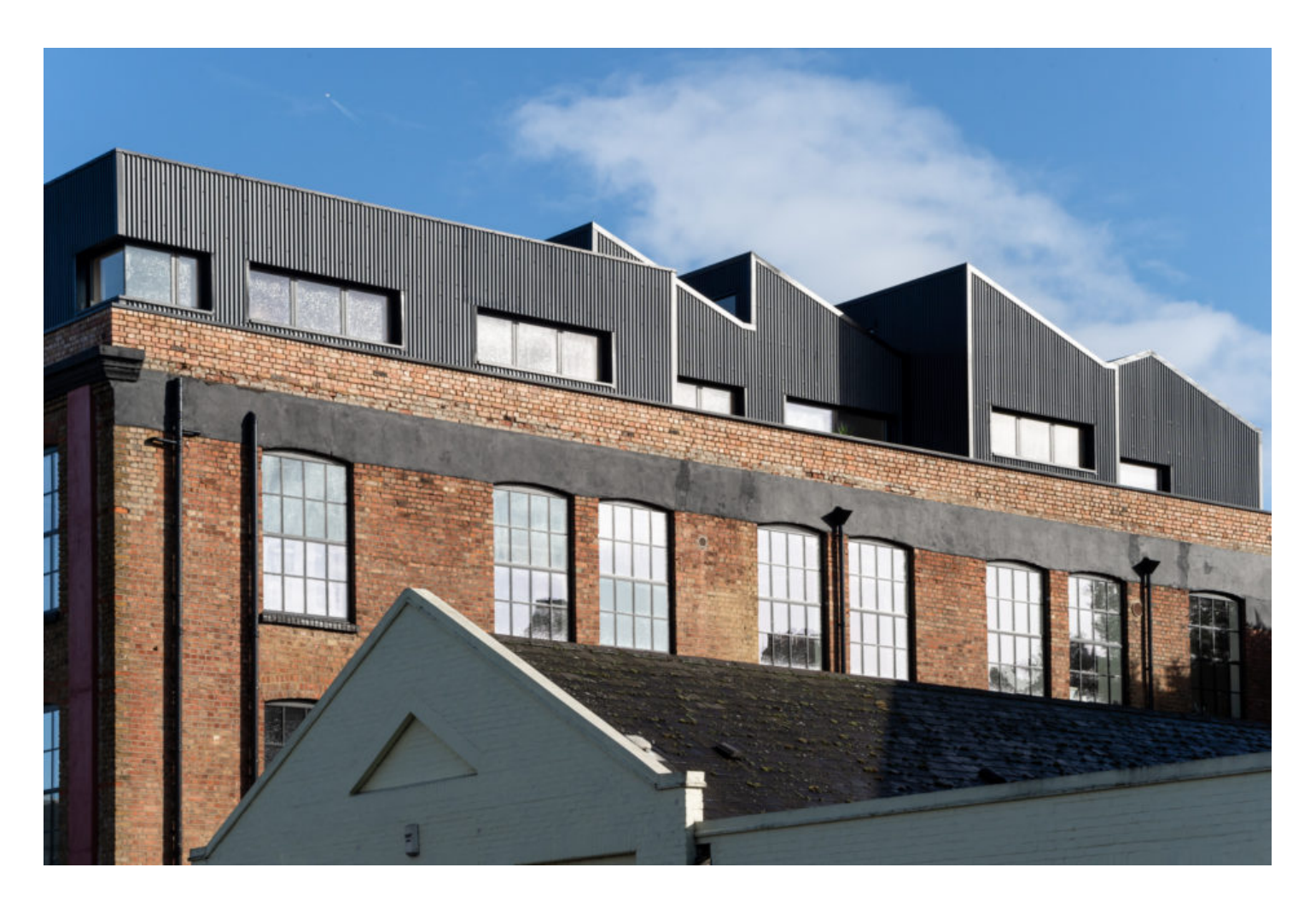
Darnley Road, London E9 Sold