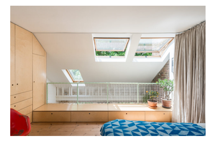
East London, London Sold