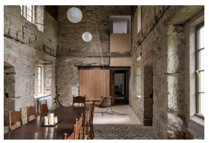
South-West England Sold