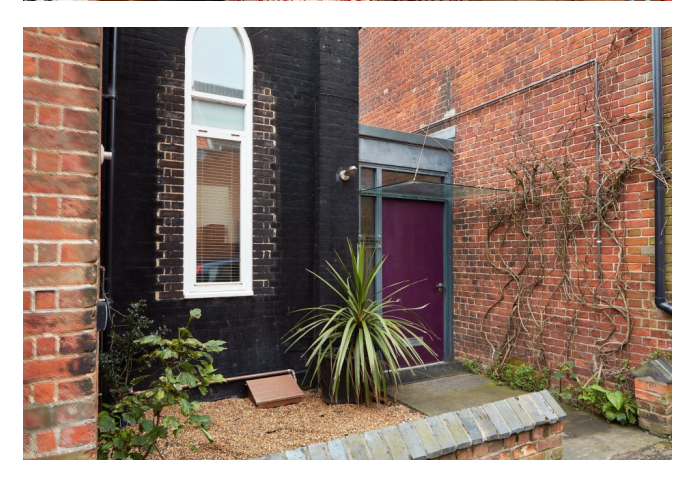
East Anglia Sold