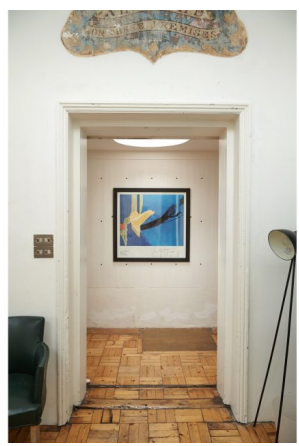
East Anglia Sold