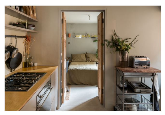
London, South London, South-East England