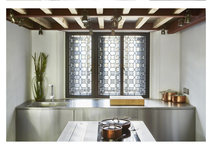
London, West London