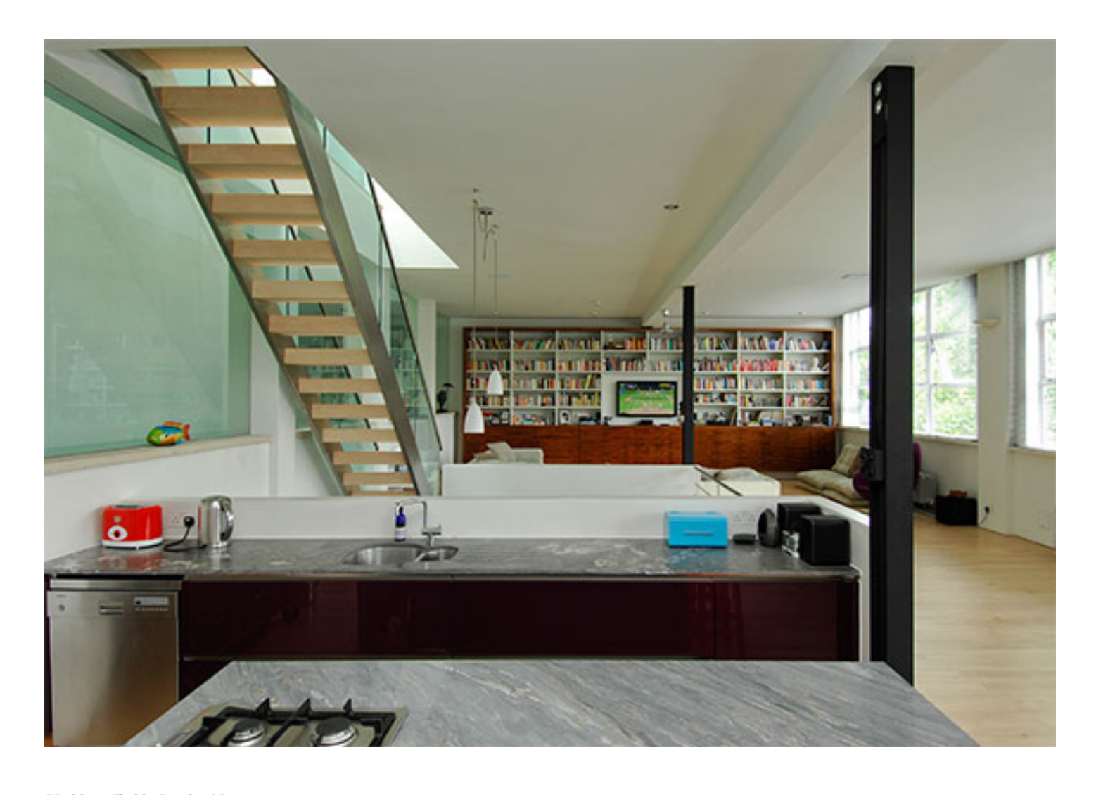
Highbury Fields, London N5 Sold