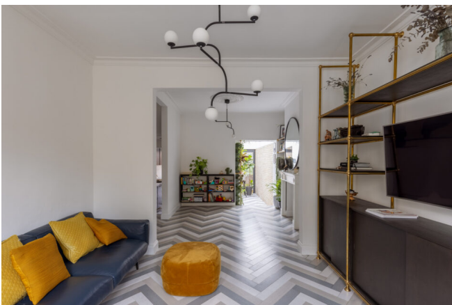
London, South London £1,175,000 Freehold